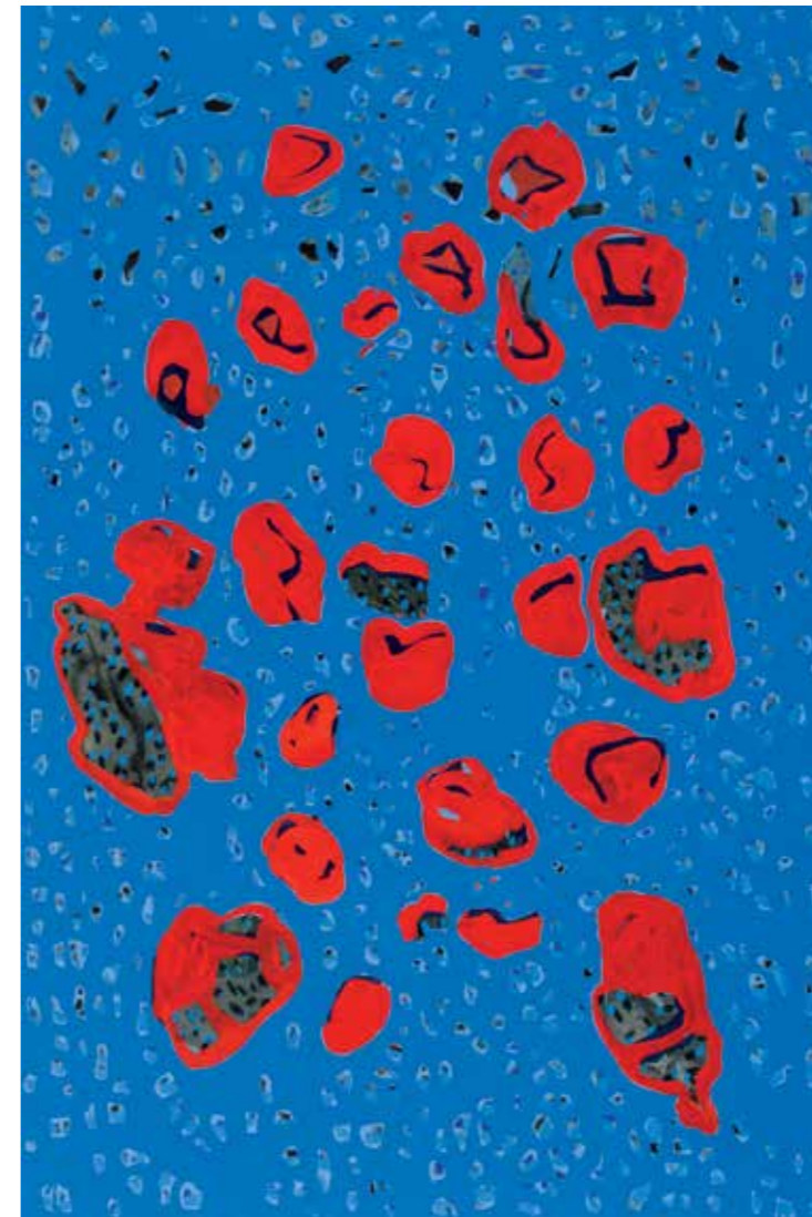
RED AND BLUE oil & acrylic on canvas 180 X 120 cm