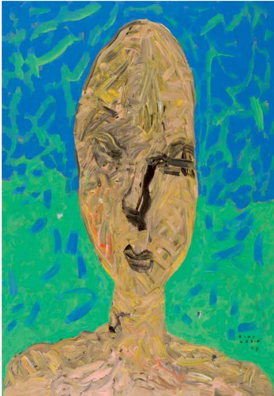
ENIGMATIC WOMAN oil & acrylic on canvas 180 x 120 cm