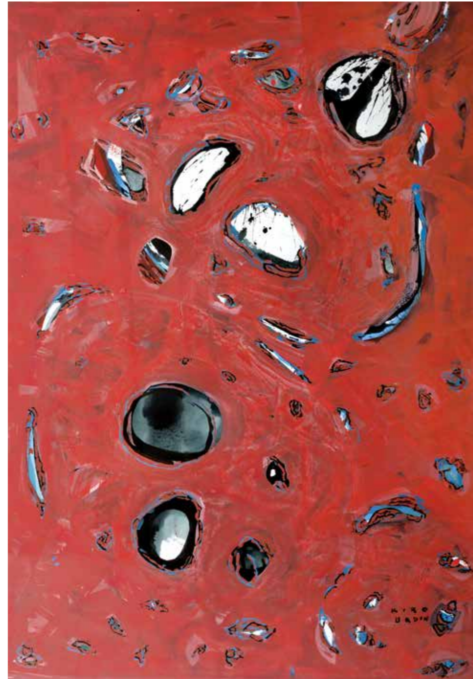
LETHAL acrylic on paper 150 x 110 cm