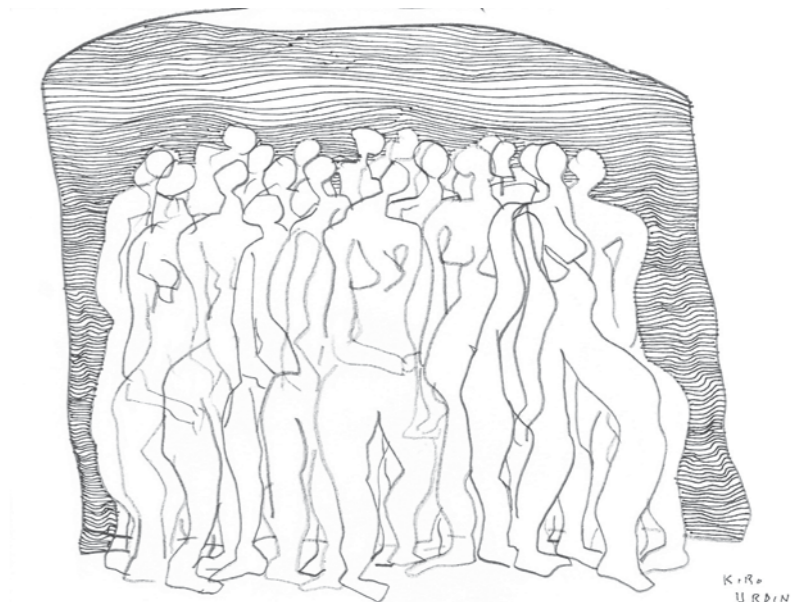
NATURAL BODIES Ink on paper, 46 X 55 cm