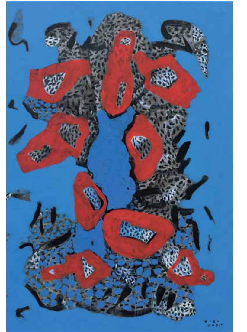
RED CIRCLES oil & acrylic on canvas 150 X 120 cm