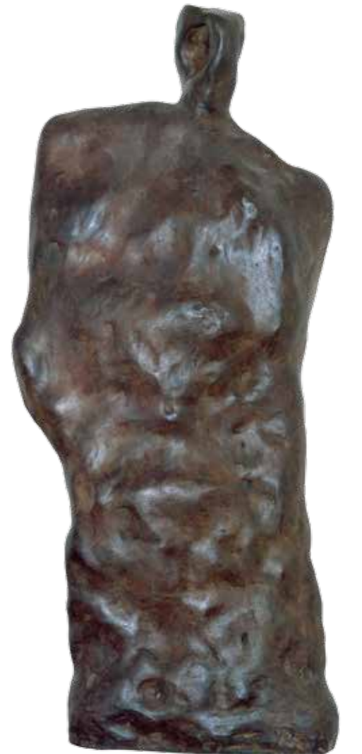
Figure bronze 1/08