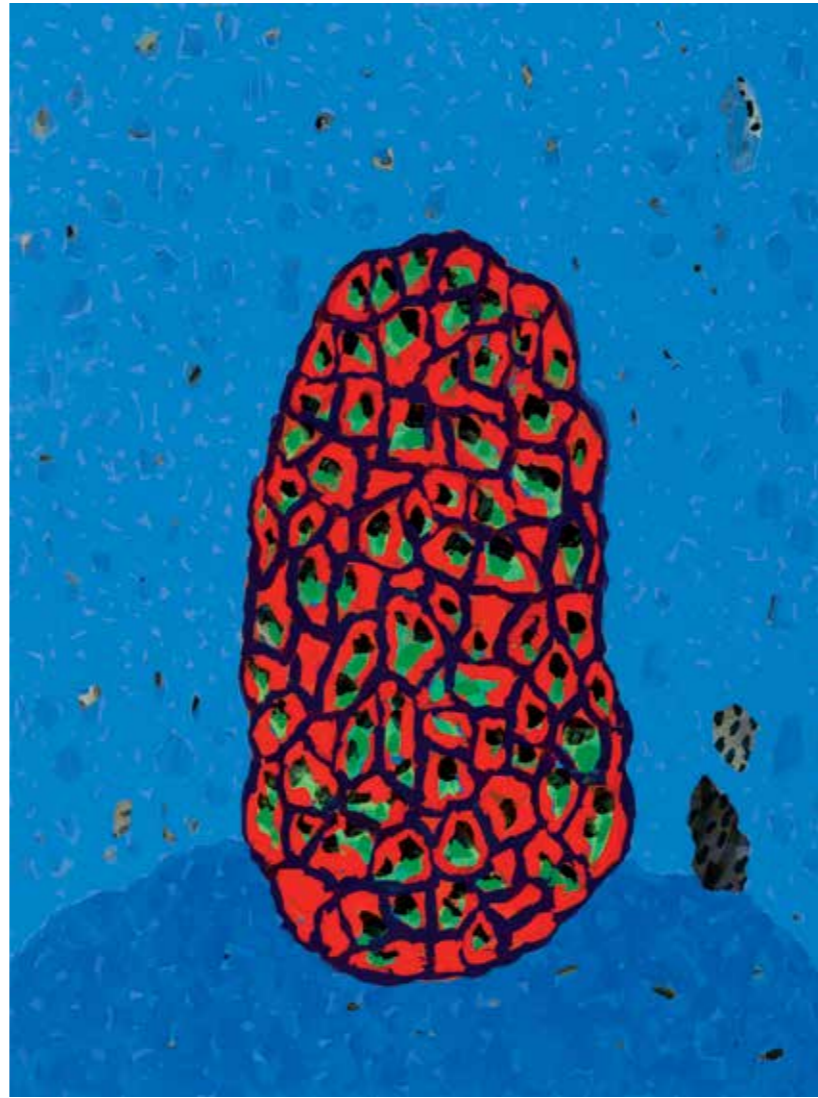
CONNECTING oil & acrylic on canvas 150 X 120 cm