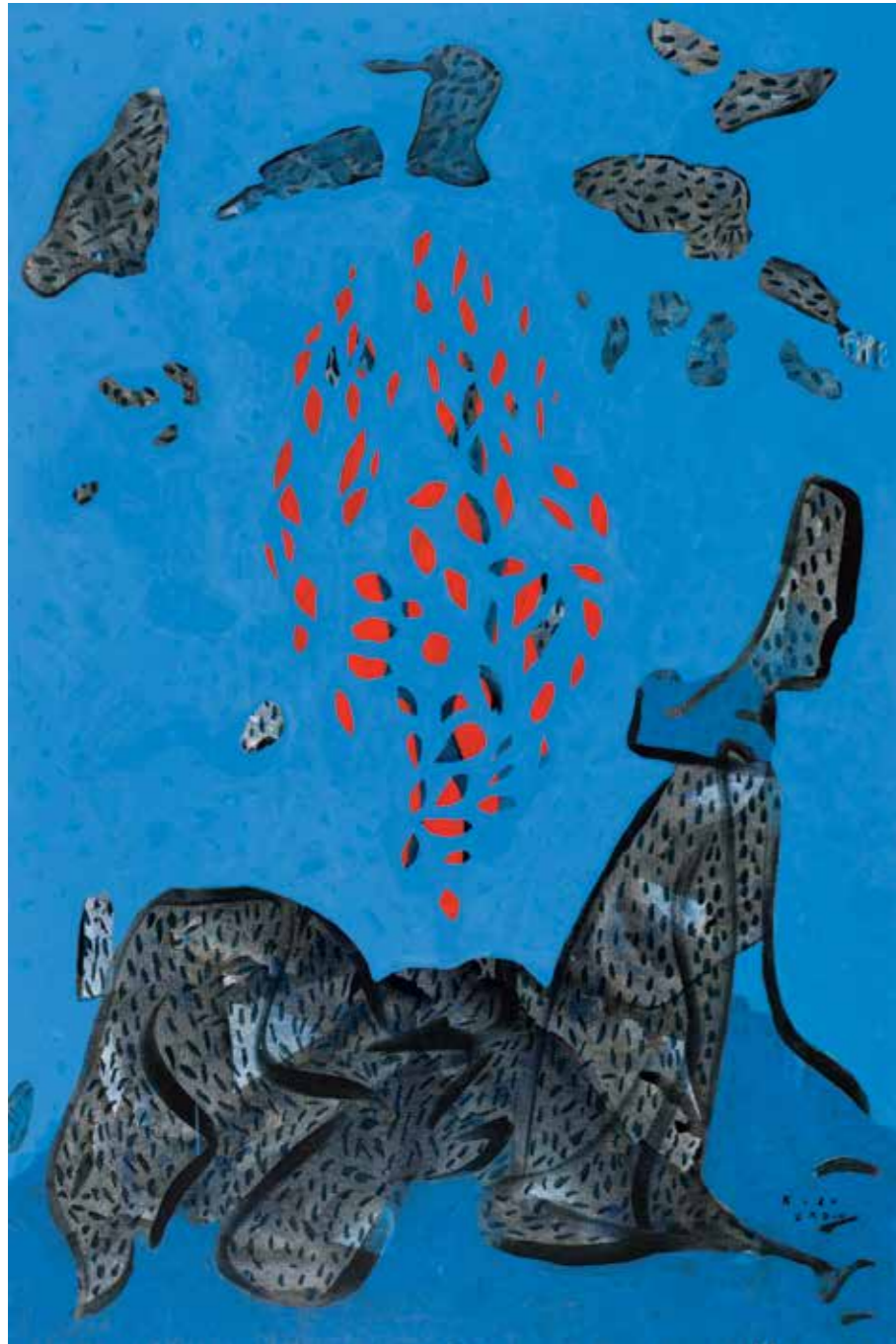
PHOENIX oil & acrylic on canvas, 180 x 120 cm