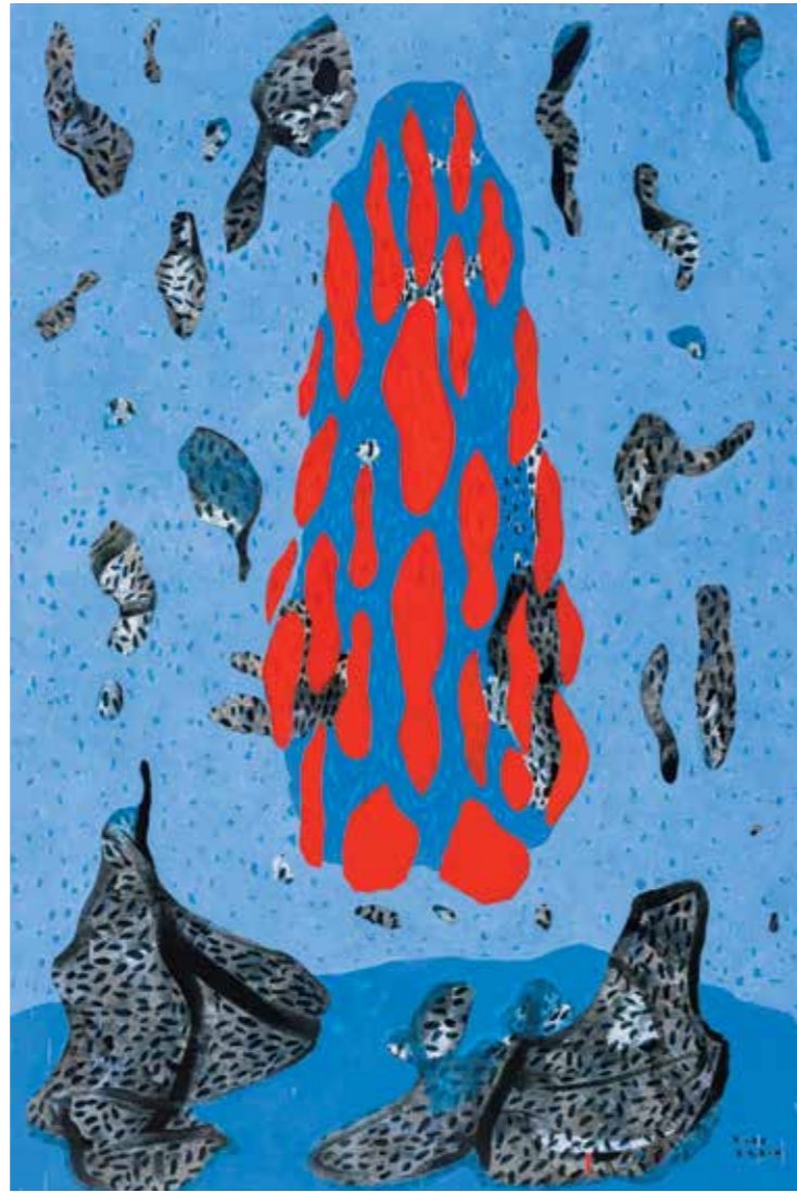
BLUE TENDRESSE oil & acrylic on canvas 180 X 120 cm