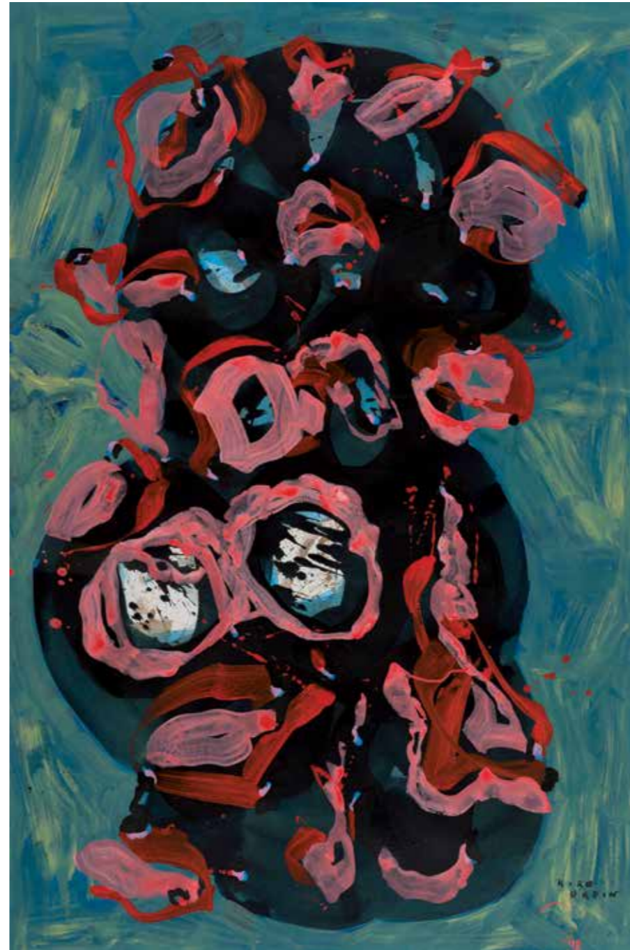
EXPERIENCE acrylic on paper 150 x 110 cm