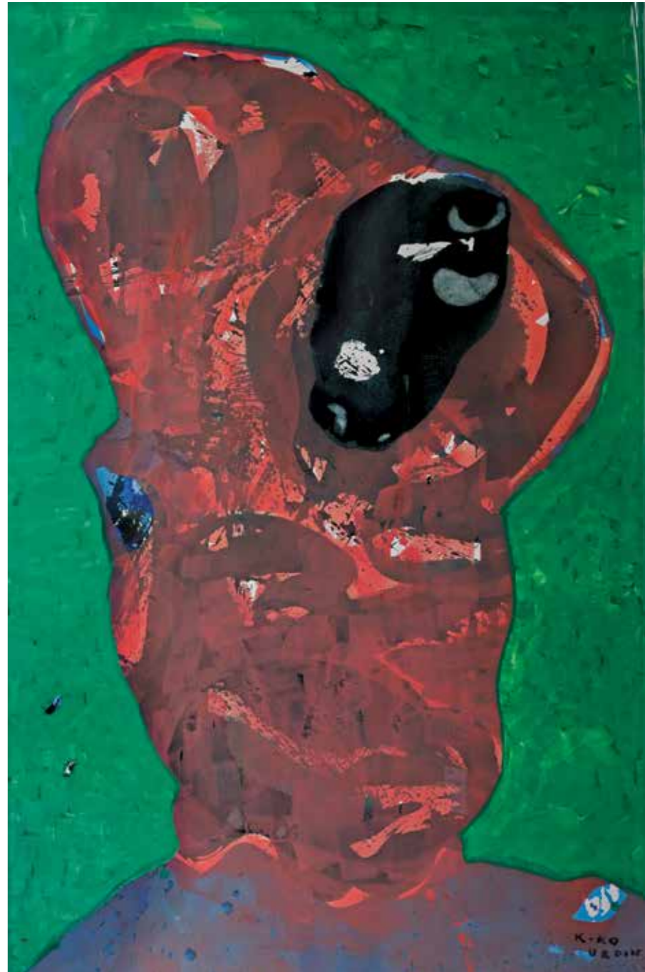
MAN OF THE GREEN RIVER acrylic on paper 150 x 110 cm