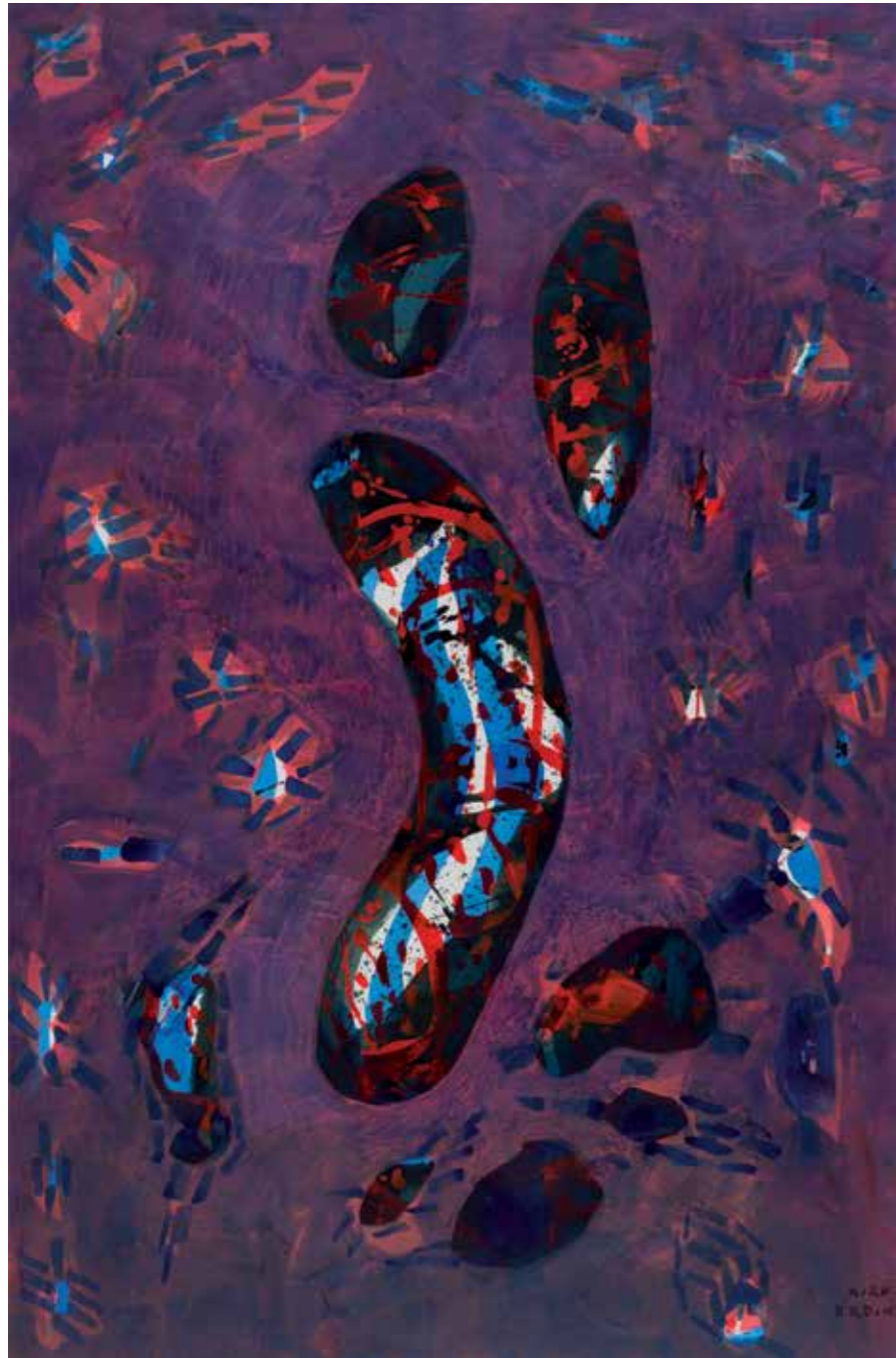
MICRO UNIVERSE acrylic on paper 150 x 110 cm