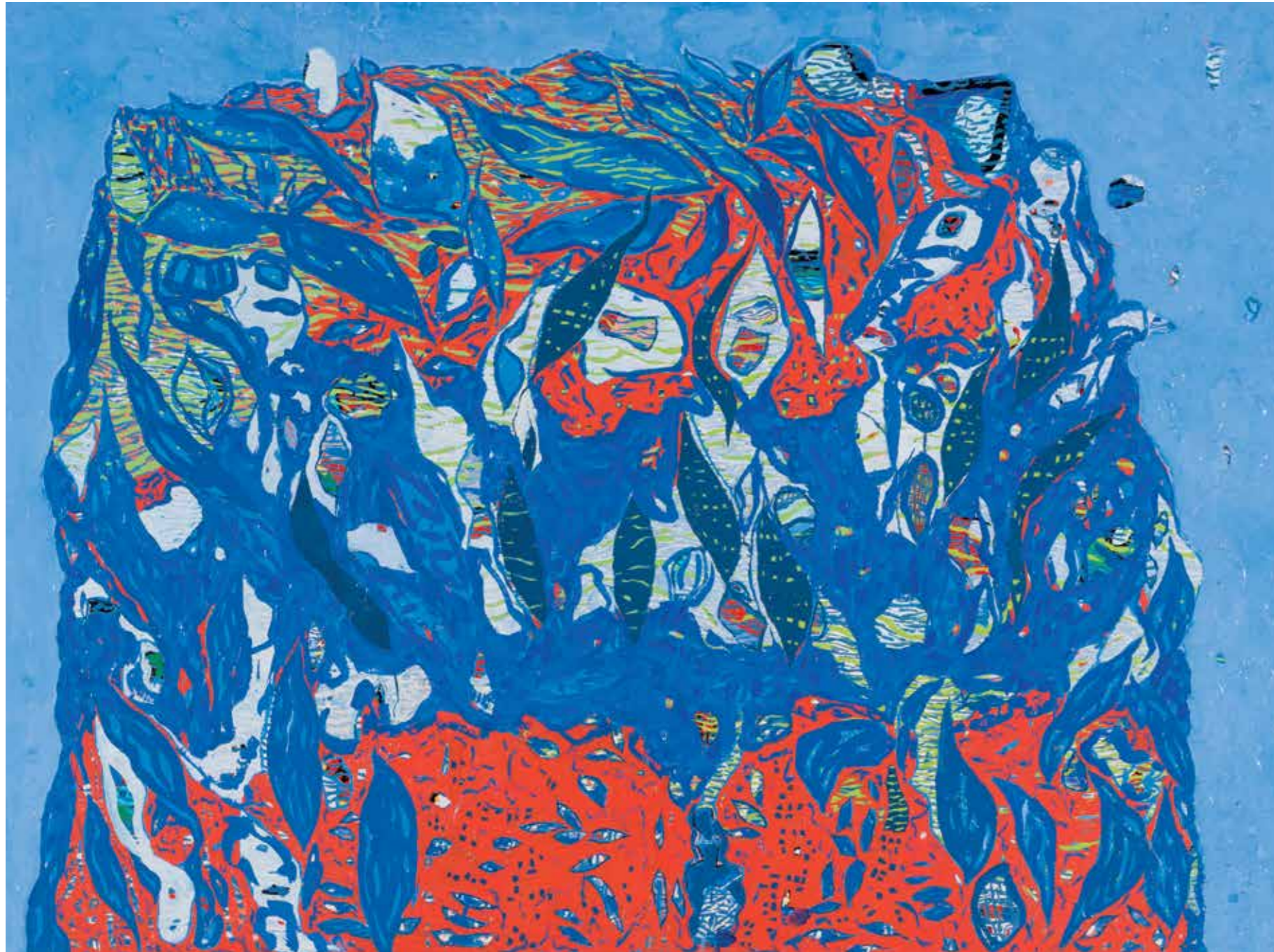
COCO ISLAND oil & acrylic on canvas 120 x 160 cm