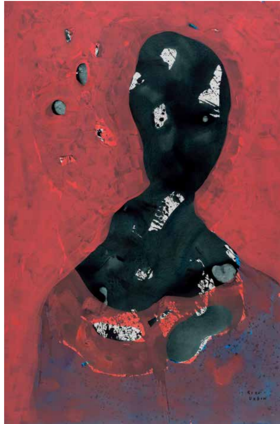
LORD OF THE UNIVERS acrylic on paper 150 x 110 cm