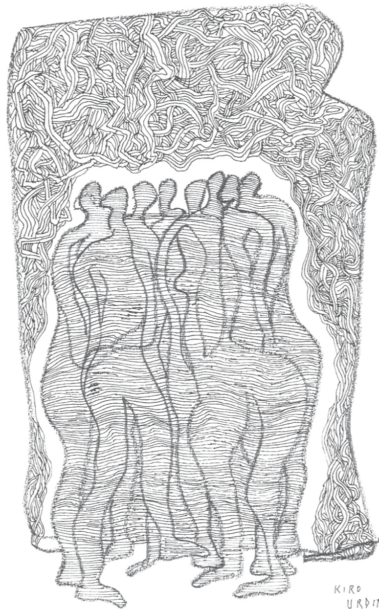
SAUNA Ink on paper, 35 X 27 cm