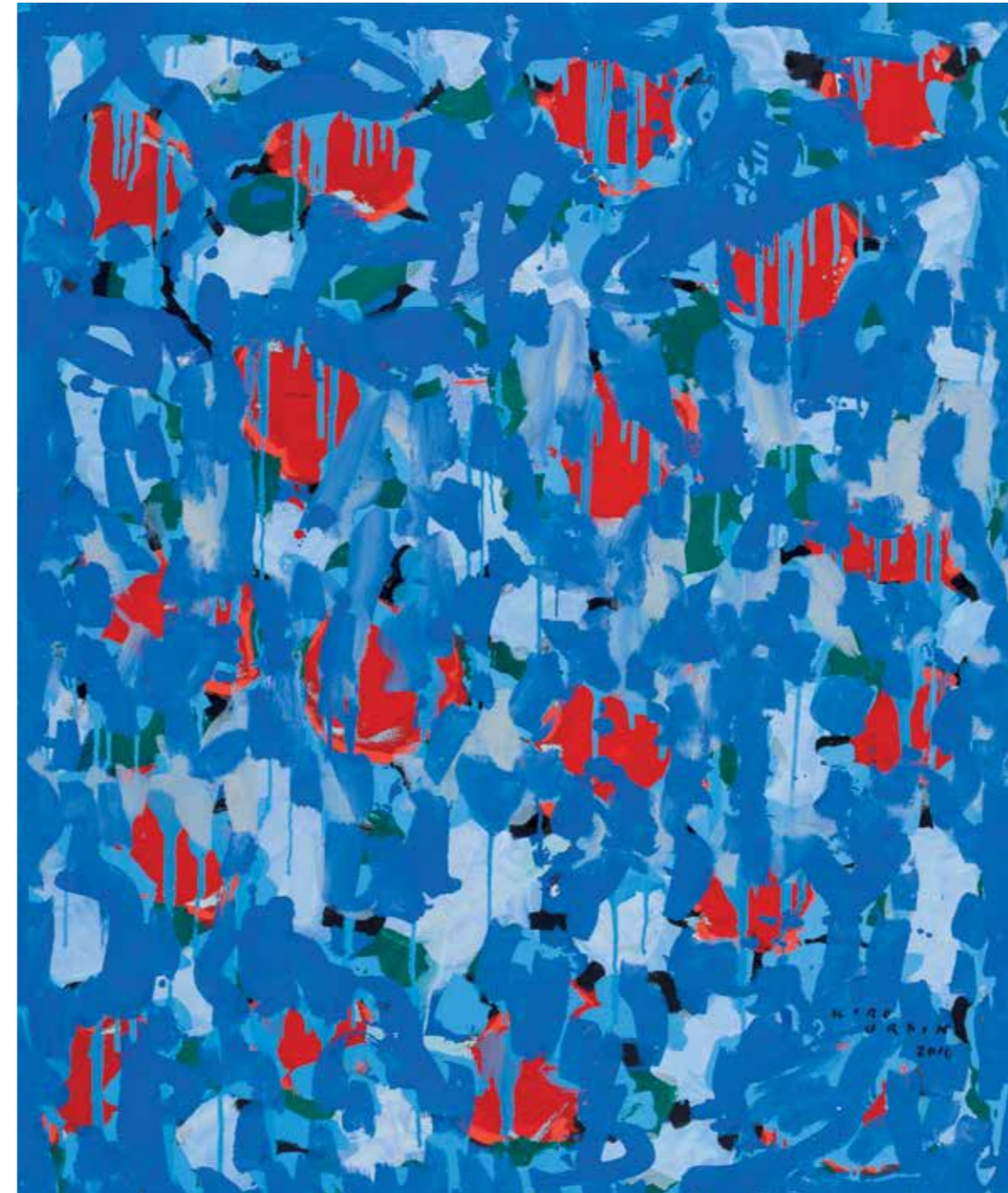
MONACO oil & acrylic on canvas 100 x 80 cm