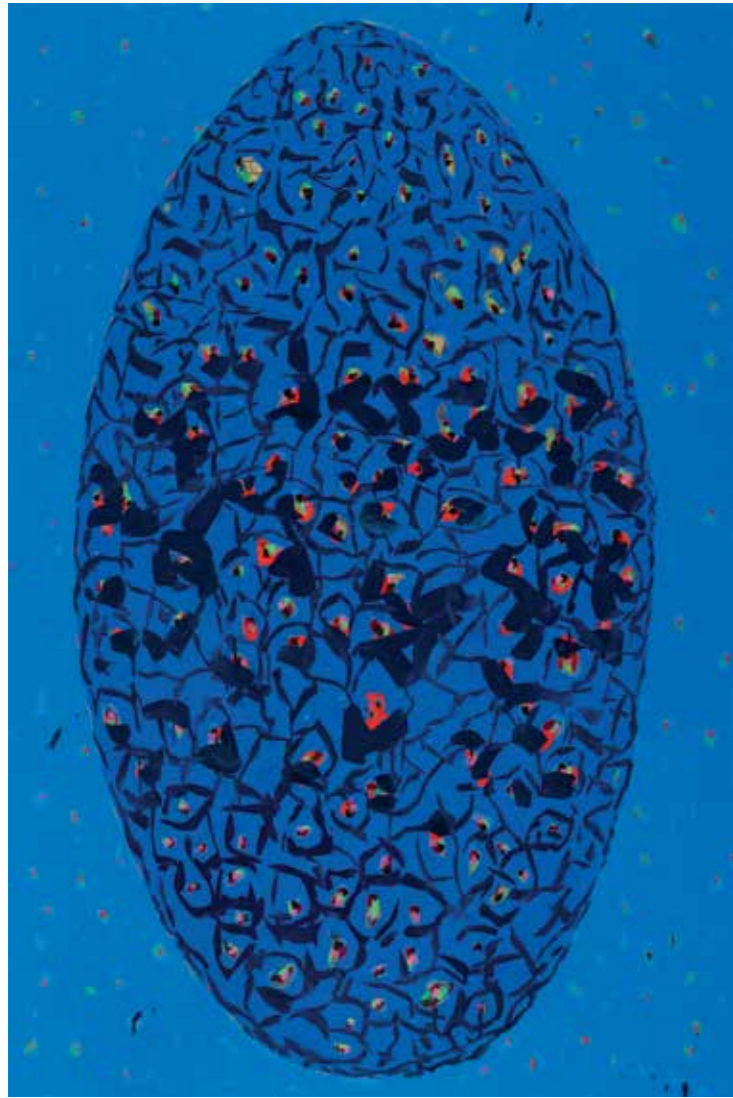
MAGICAL FORM oil & acrylic on canvas 180 X 120 cm