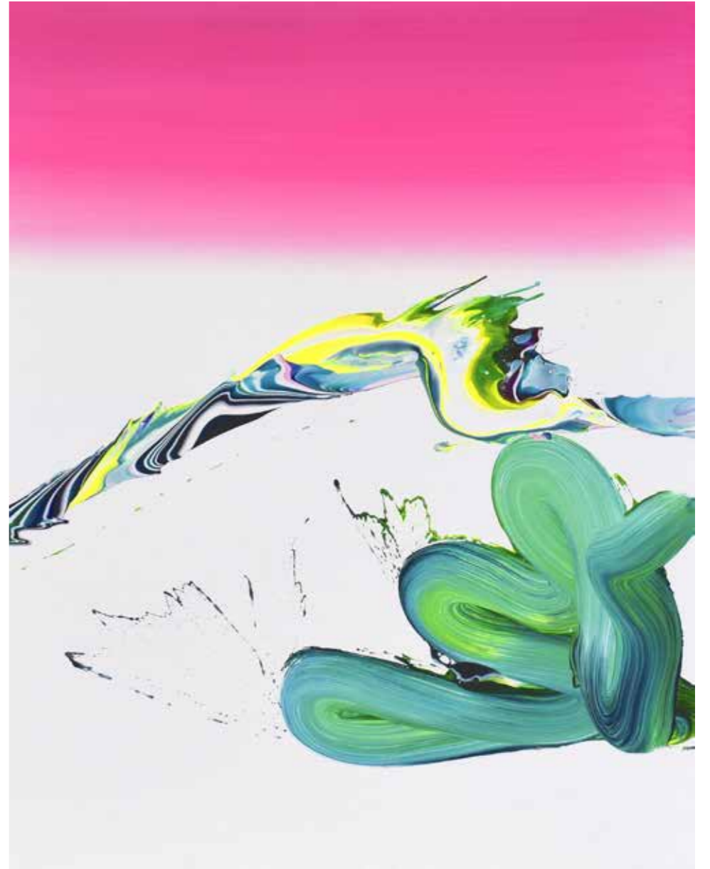
Alex VOINEA 2019 av_631 Tiptych 162 x 390 cm acrylic on canvas