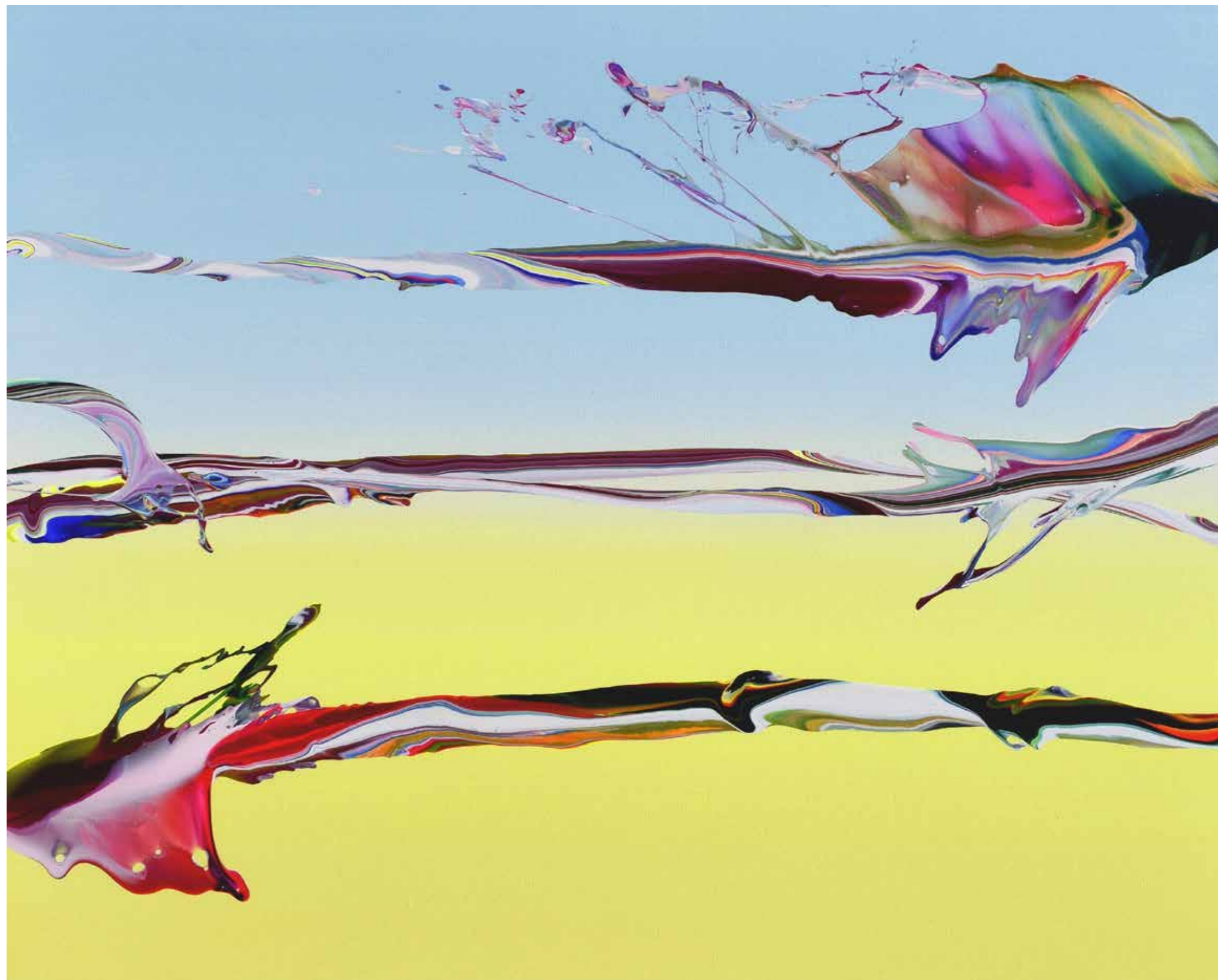
Alex VOINEA 2019 av_633 162 x 130 cm acrylic on canvas