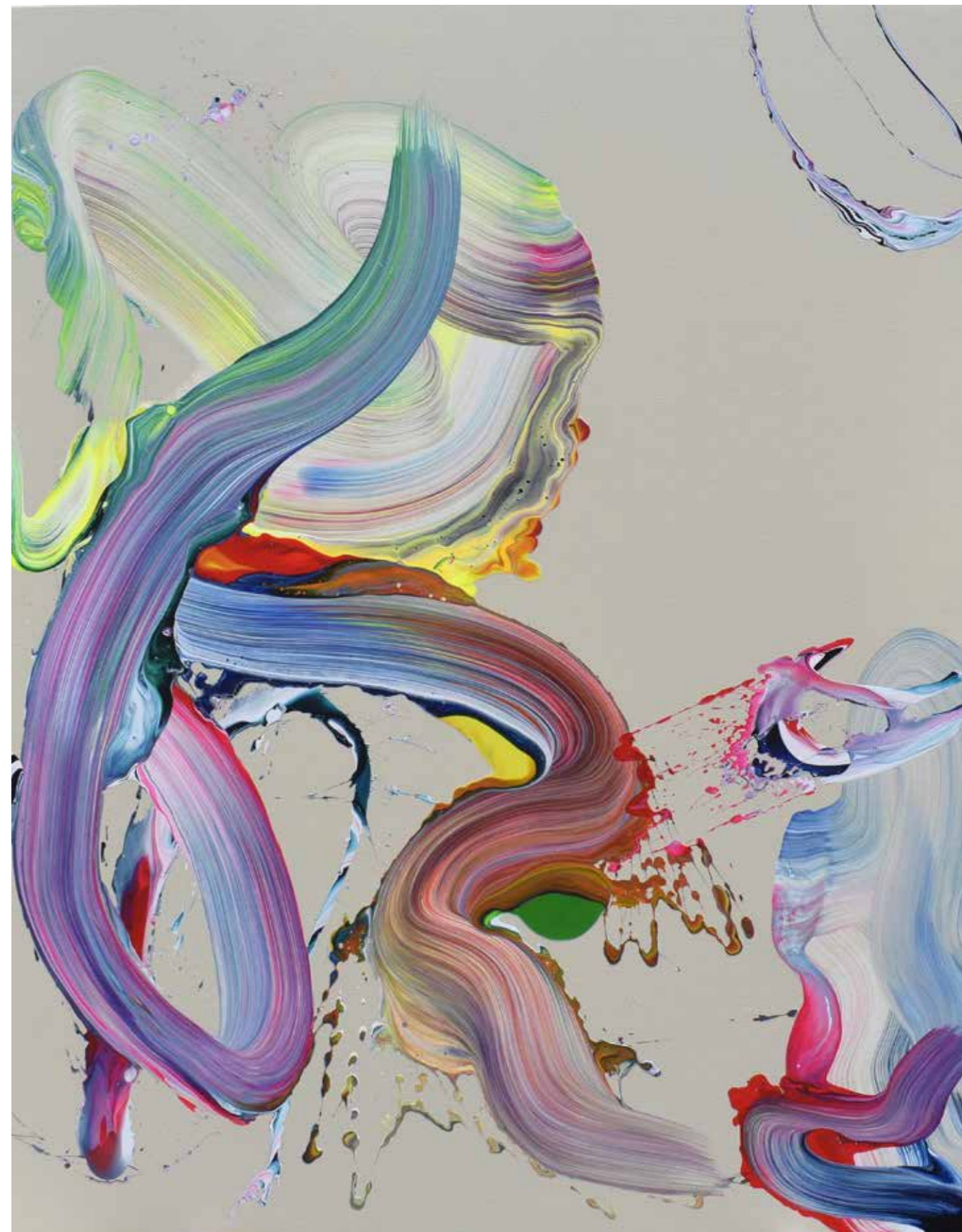
Alex VOINEA 2019 av_597 146 x 114 cm acrylic on canvas